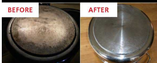
Before & after treatment with Innosoft B570